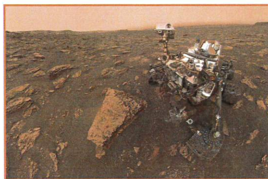
A self-portrait taken by NASA's Curiosity rover.

radiation – Energy emitted by the Sun, some of which is dangerous to humans when not absorbed by the atmosphere of a planet.